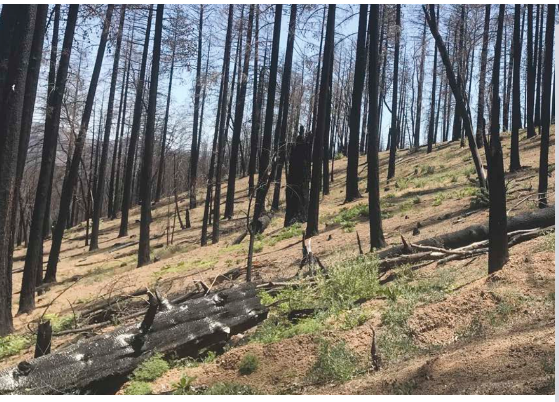
A small portion of the Mendocino National Forest, California, that burned during the 2018 Mendocino Complex.

Passive or Active Management? Understanding Consequences and Changes After Large Stand-Replacing Wildfires