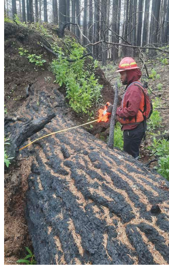
Xavier Lee, 2021 Reseach with Underserved Communities Fund Intern, measures a fallen tree at a study site on the 2020 Beachie Creek Fire in the Bureau of Land Management Northwest Oregon District.

interdisciplinary teams responsible for assessing the environmental impacts of proposed post-wildfire management on a particular national forest or BLM unit. His research objectives are included in official NEPA documentation and may serve as a model for future fuel salvage logging projects.