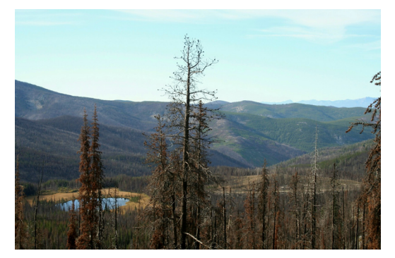
MPB-affected lodgepole pine and fire damage in the Tripod Complex burn area.