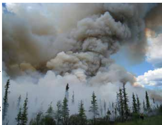
A smoke column develops during an experimental burn outside of Fairbanks, Alaska.

Duffy and colleagues took a combined approach to forecast the response of the interior Alaskan boreal forest to climate change. The field component of the study used burn severity data collected from 392 plots across 10 sites in the boreal forest that