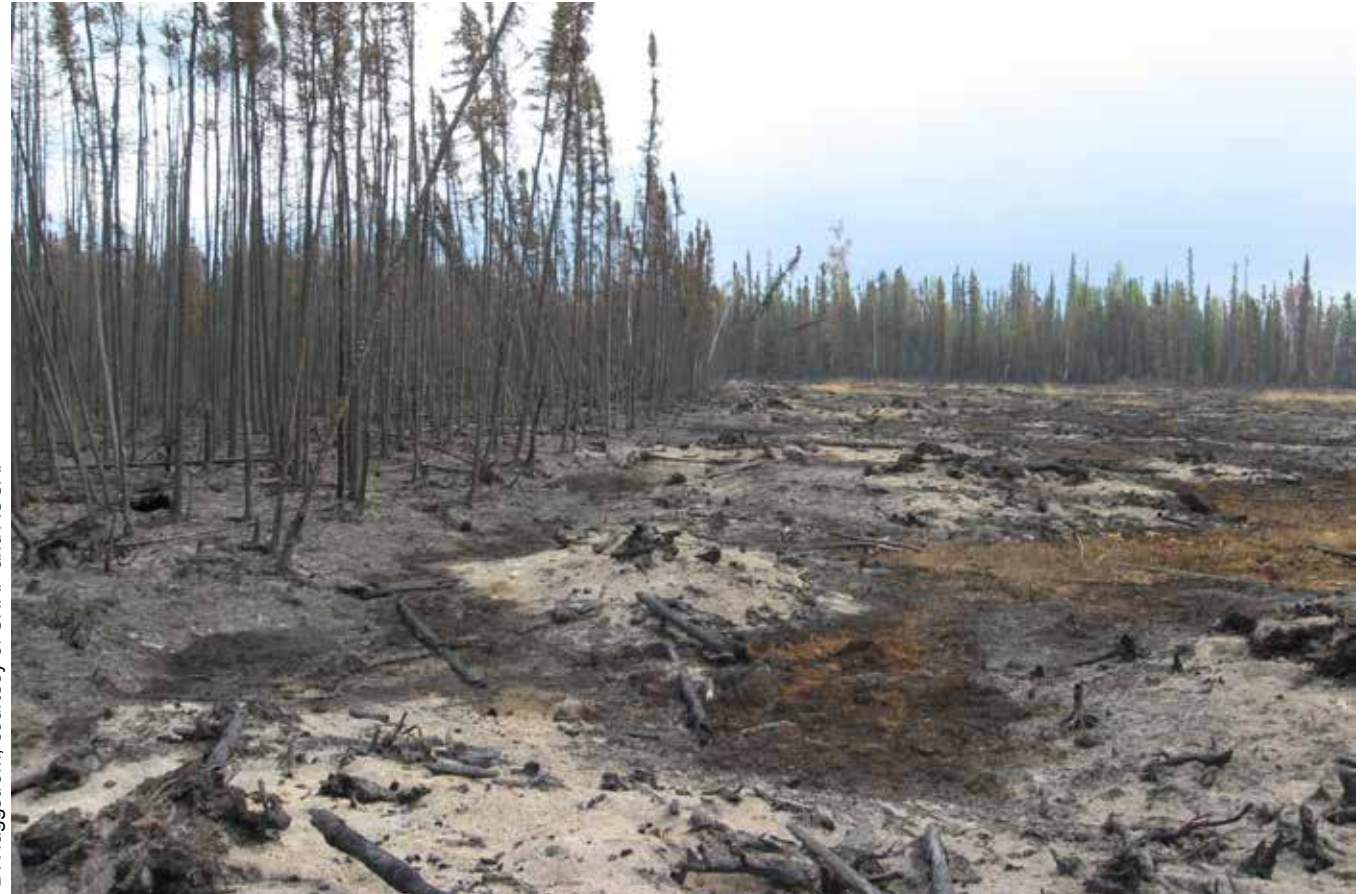
D. Haggstrom, courtesy of SNAP and ACCAP