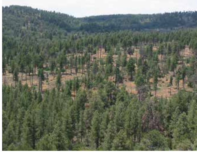
This photo shows the Mount Trumbull Ponderosa Pine Ecosystem Restoration Project in northwestern Arizona. The landscape in the foreground has been treated, whereas the landscape in the middle ground is untreated.

The researchers combined historic data and modeling of future warming scenarios. A modified version of a forest simulation model, the widely used Forest Vegetation Simulator, was used to project