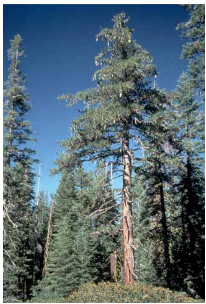
Sugar pine survival is at risk in the presence of more frequent fires since the species takes 30-40 years to reach reproductive maturity.

To determine whether warm, dry conditions will increase the probability of trees dying after a fire,