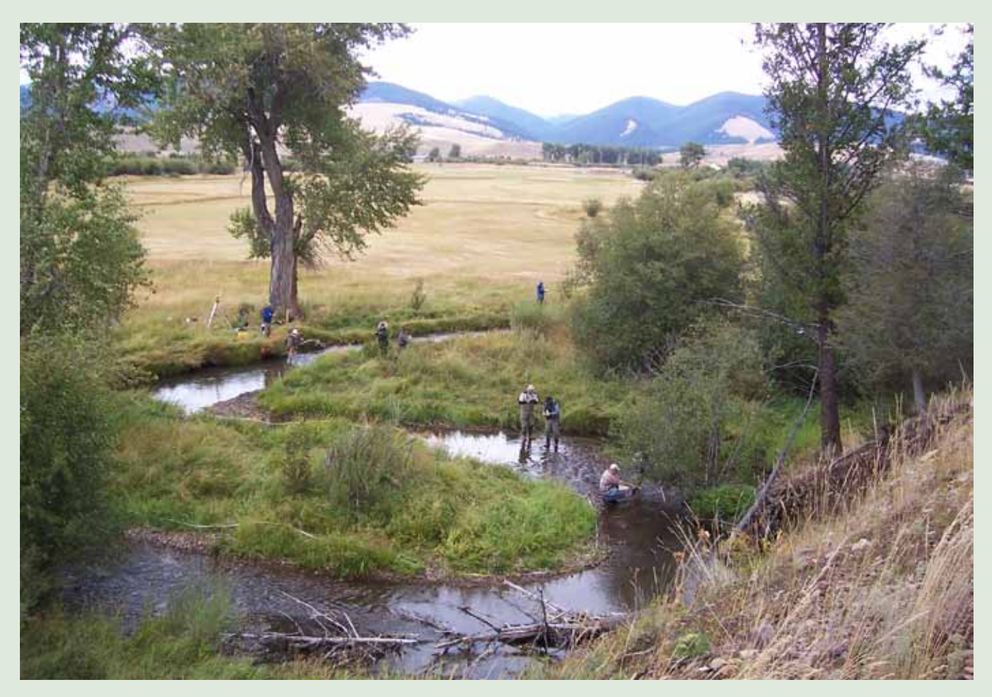
The Blackfoot Drought Committee was established in 2000 to address declining fisheries and water allocation in the Blackfoot river basin in western Montana.

Drought Committee members point to two factors that make the plan effective: users were invited to help craft the management plan, and the state has always been willing to work with users to seek alternatives to shutting down operations. The state retains its authority to enforce water rights and close areas to fishing, but generally relies on the concept of shared sacrifice rather than formal enforcement to maintain compliance.