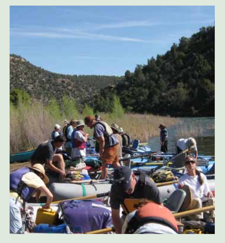
The Lower Dolores Working Group used joint fact-finding to address disagreement over the condition of native fisheries and minimum flow needs for whitewater boating.

The group agreed at the outset that they would accept the experts' collective synthesis of the science, but that the scientists' management options would be further evaluated for social, economic, and legal feasibility. A subcommittee, including agency decision makers and county elected officials, environmental group representatives, and water users, discussed and refined the management options in terms of legal and fiscal feasibility and water users' needs. The group then separated the options into those that could be implemented immediately and those that would require fundraising or policy changes.