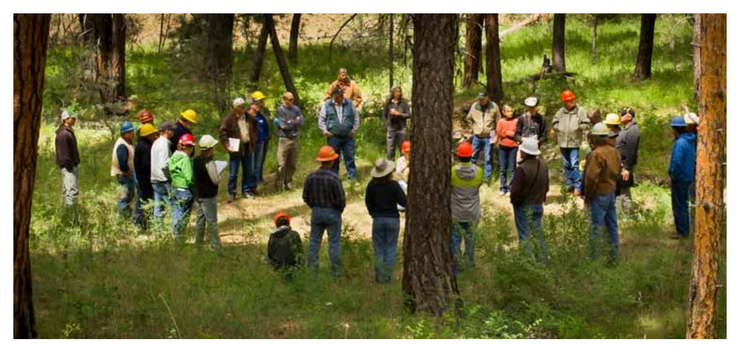
Some collaborative resource management groups are using structured procedures to collectively evaluate their work and adapt their plans and management actions.

Appendix II and III provide more details from the rapid assessments. Appendix II includes case summaries of evaluation and adaptation in three collaborative groups, the Bankhead Liaison Panel, Blackfoot Drought Committee, and Dinkey Collaborative. Appendix III provides worksheets and examples of several of the tools discussed in the sourcebook.