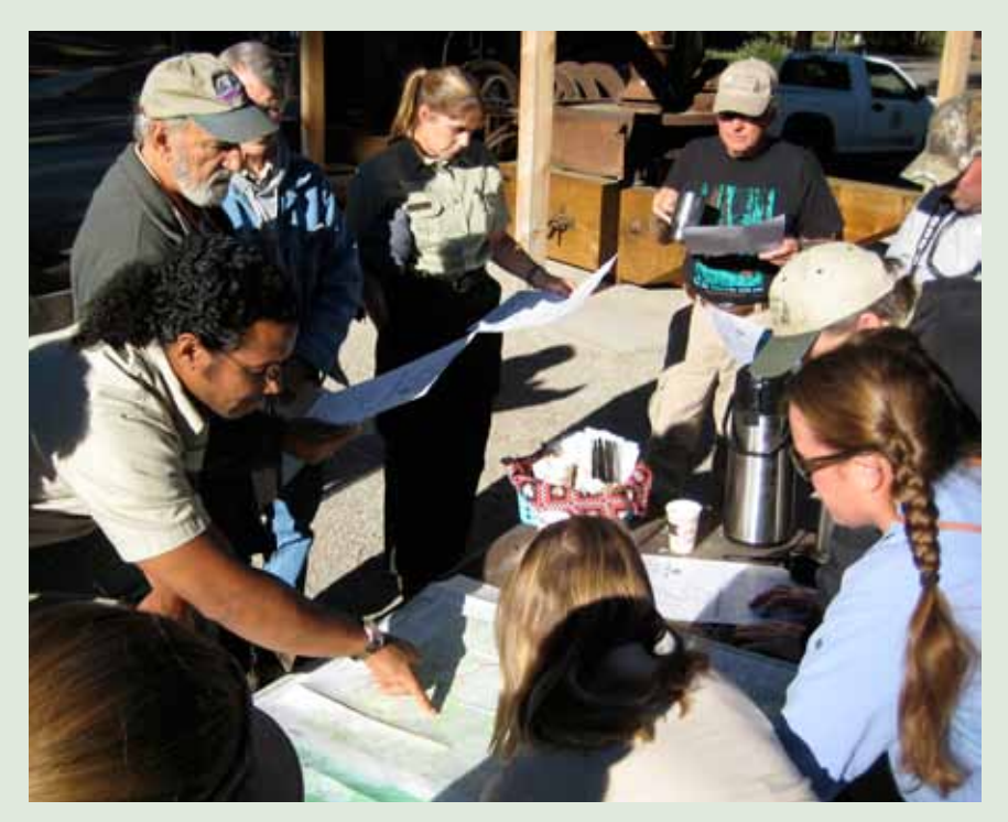
For the Dinkey Collaborative in California, the process of field reviews and adjusting management is important because it builds trust and allows ongoing management improvement.

The Dinkey Collaborative in California was created in 2010, when the Sierra National Forest was awarded a Collaborative Forest Landscape Restoration Program project. The Dinkey Collaborative's charter includes provisions for biennial review and amendment of the charter itself. In 2012, charter review resulted in several recommended clarifications. including procedures for documenting group agreements and disagreements, clearly delineating when decision points are reached, and distinguishing decisions from recommendations.