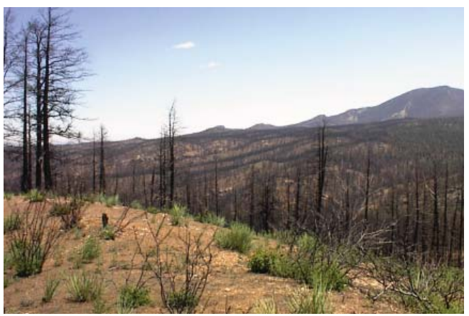
A portion of the Hayman Fire landscape, one year after the fire.

Approximately half the Hayman Fire burned with mixed-severity. Overly dense forests and extreme fire weather caused the remainder to burn severely, creating unusually large areas where tree mortality was 100 percent. "There are areas out there thousands of acres in size that are now without a single living tree," Kaufmann says.