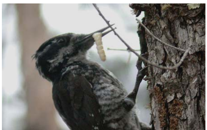
An American Three-toed Woodpecker feasts on a bark beetle grub.

The American Three-toed Woodpecker is a frequent inhabitant of severely burned forests. The newly killed and dying trees create good habitat where the birds forage in high concentrations for their primary food source—wood boring and bark beetles. But our understanding of how they used burned landscapes beyond this is limited. Managers want to know more about the details, particularly with regard to postfire management.