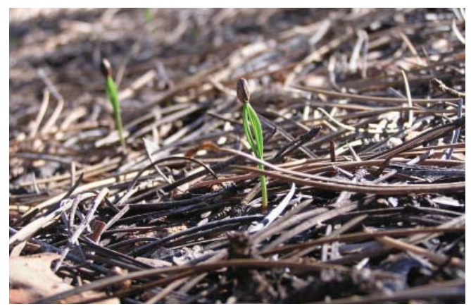
A ponderosa seedling signals new beginnings in an area of the Hayman where overstory trees survived.

She adds that there may be another, longer term benefit: choosing dead trees adjacent to live trees may be a way of looking ahead. Carr notes that beetles come and go relatively quickly after fire-within three to five years-and that many trees that initially survive fire eventually die during that period from stress or fire injury. These trees provide a follow-up food supply and additional nest sites for the coming years. "These birds live a boom and bust lifestyle," she explains. "Right after fires, the pickings are great, but after a few years the woodpeckers probably have to range over much larger areas of the forest to find the same amount of food." She emphasizes that it's important for managers to consider the longer-term food supply when managing postfire landscapes for the preservation of three-toed woodpeckers and recommends that more snags and dying trees be retained to provide extended foraging opportunities.