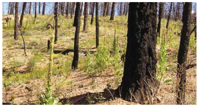
Three years postfire the noxious weed mullein grows among vigorously re-sprouting native understory plants.

"We now know that it's very important to be aware of what existed before. That way if it burns you'll know what to expect. It gives you the opportunity to start thinking about what to do."